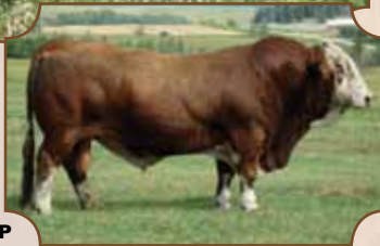
BAR 5 SA STRIDE 413P