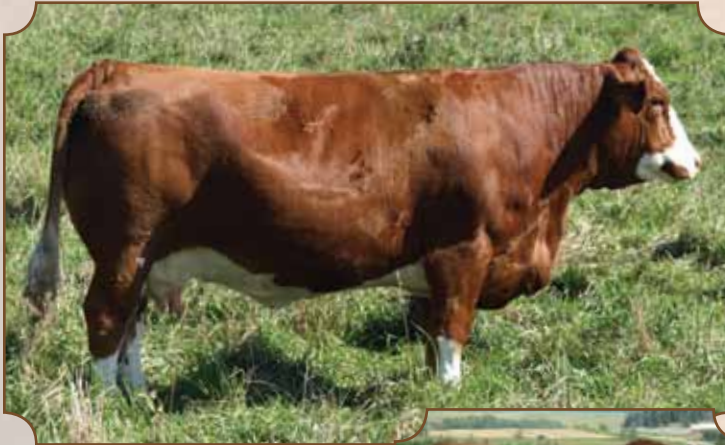
BHR BARONESS SA 2857P